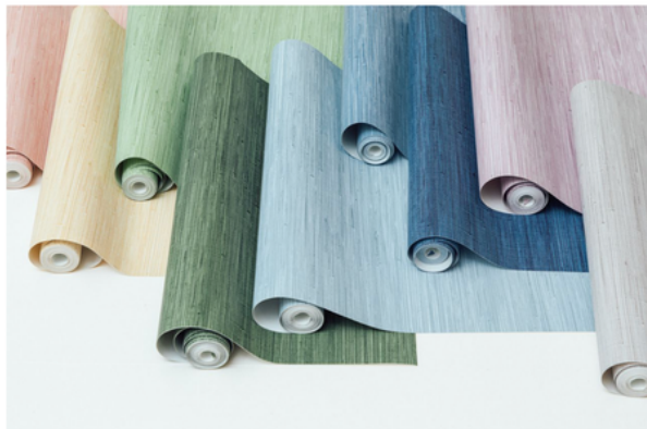
Faux Grasscloth Peel and Stick Wallpaper, $50 a roll, ShopSocietySocial.com