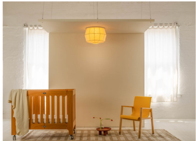
“Gem” shade in sunlight, $145, TulipShades.com

If you’re contending with harsh overhead bulbs or dowdy recessed lighting, a new look can transform a lackluster room fast. It was the need to disguise bare bulbs and generic, big-box-store fixtures that drove Austin, Texas-based interior designer Lori Smyth to launch Tulip , her line of