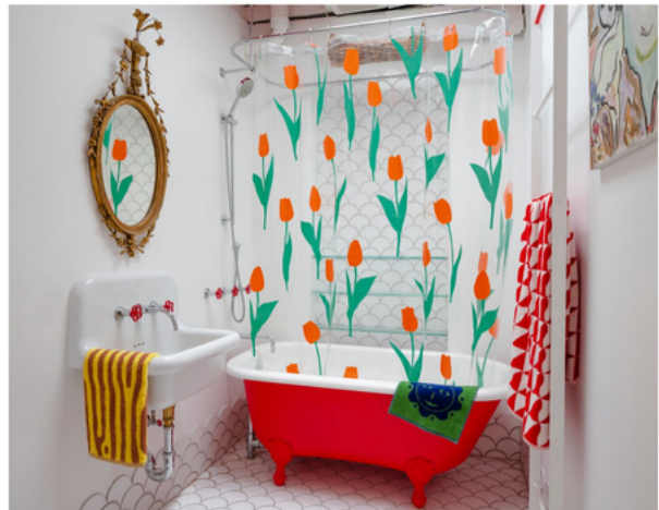
Tulip Shower Curtain in Red, $56, DusenDusen.com

If a bathroom feels sterile, “we’re a fan of adding...a patterned shower curtain,” said Montgomery. Ariel Kaye, a Los Angeles-based interior expert and the founder of lifestyle brand Parachute, concurred: “The right one can really showcase your design sensibility.” Reach for Dusen Dusen’s $56 transparent ruby tulip-dotted version for instant pop or a scalloped-edged, begonia-bedecked option from Rhode + West Elm for “vintage charm.” When it comes to sprucing up a so-so bathroom that has never yielded joy, there are few easier ways to get your feet wet.