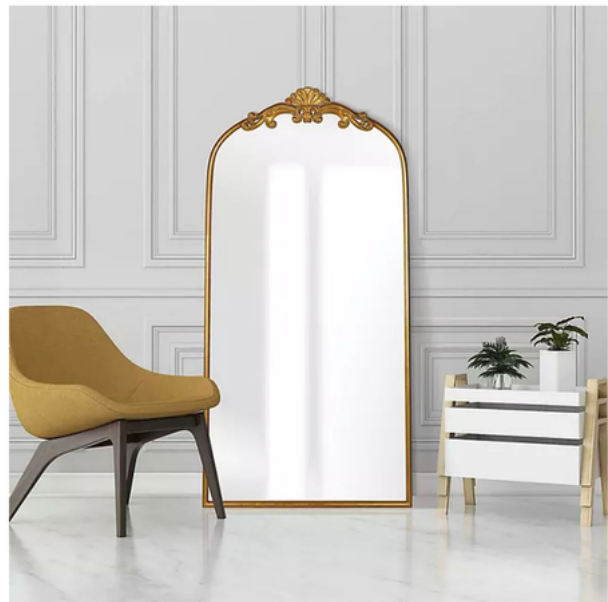
Azalea Park Filigree Floor Mirror, $150, SamsClub.com

Whether oversize or petite, “mirrors can completely transform a room...by reflecting light and showcasing unexpected angles,” says New York-based designer Jacqueline Young. “Don’t be afraid to add a mirror to the bedroom,” she said. “Just try to avoid the ceiling.” Her bargain tip: The $150 Azalea mirror